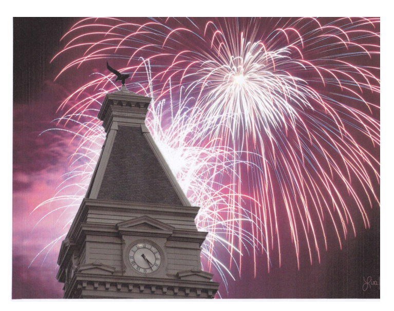
Cover of our Cookbook