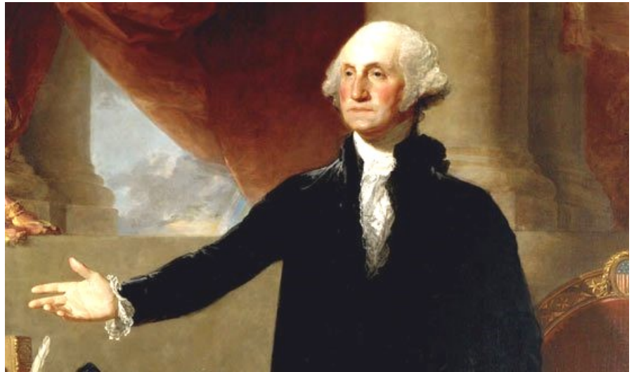
George Washington: "If the freedom of speech is taken away then dumb and silent we may be led, like sheep to the slaughter."