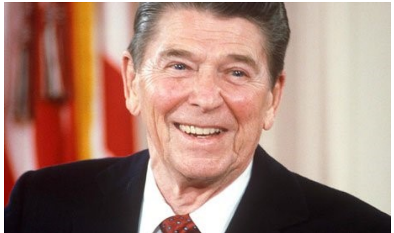
Ronald Reagan: "Freedom is never more than one generation away from extinction. We didn't pass it to our children in the bloodstream. It must be fought for, protected, and handed on for them to do the same, or one day we will spend our sunset years telling our children and our children's children what it was once like in the United States where men were free."